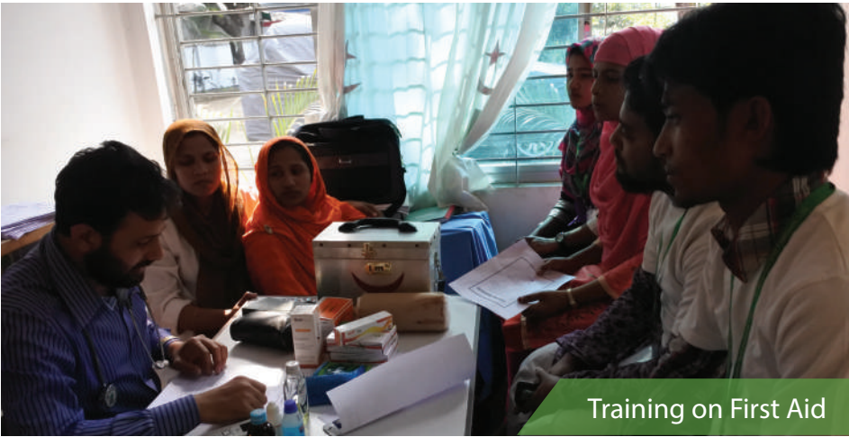
Training on First Aid