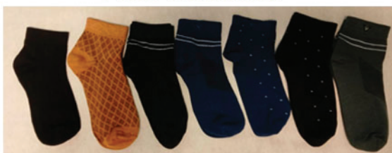
Ankle Short Socks