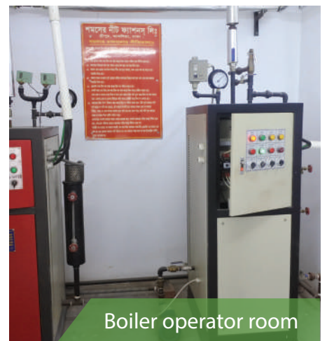
Boiler operator room