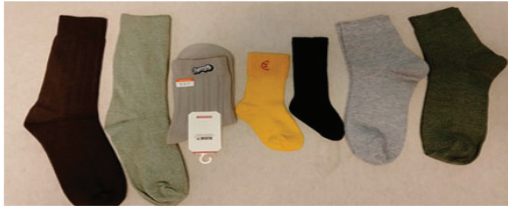
Double Cylinder Classical Rib Socks