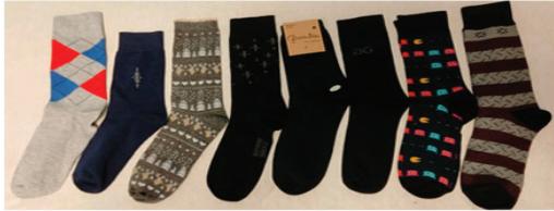
Double Cylinder Classical Rib Socks