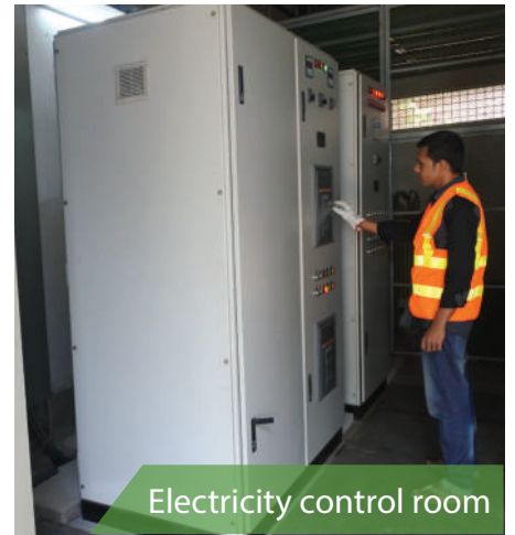
Electricity control room