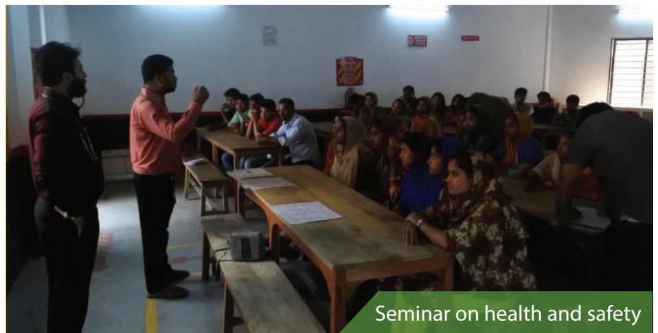
Seminar on health and safety