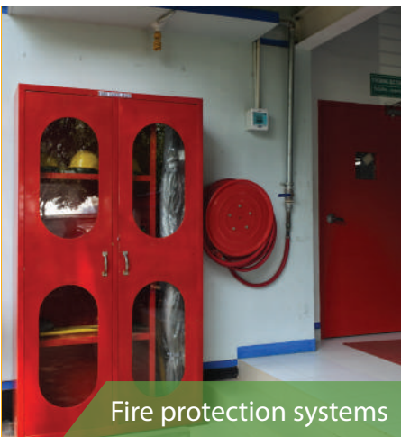
Fire protection systems